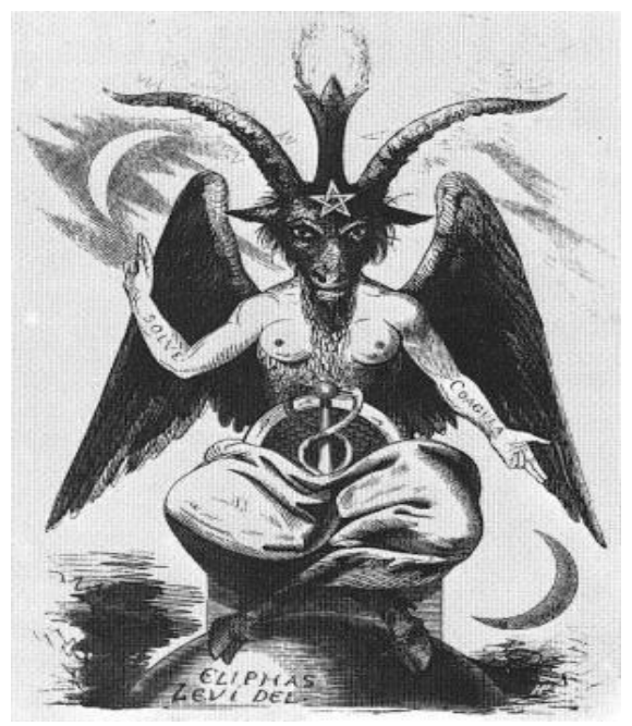
Elias Levi's "Baphomet" depiction of Satan.

the rites of "sexual-magick", a process of spiritual enchantment that uses ever extreme forms of sexual degradation to break down inhibitions and allow for systematic demonic possession of the initiate.